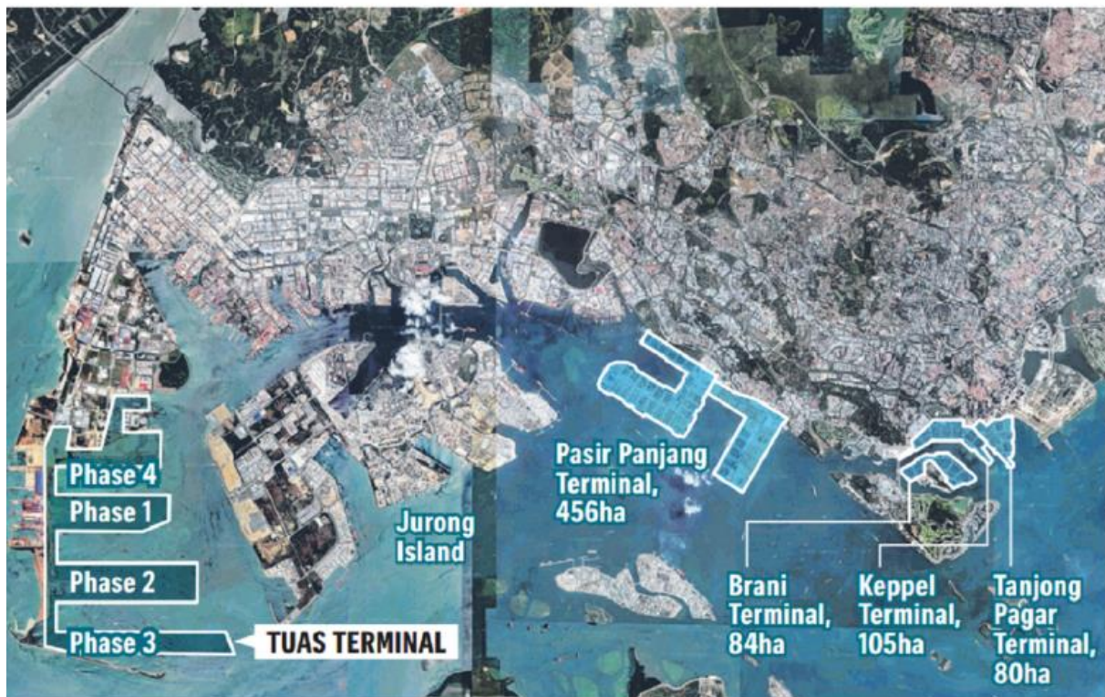
Fig. 3. Arrangement of ports and their respective terminals in the port of Singapore