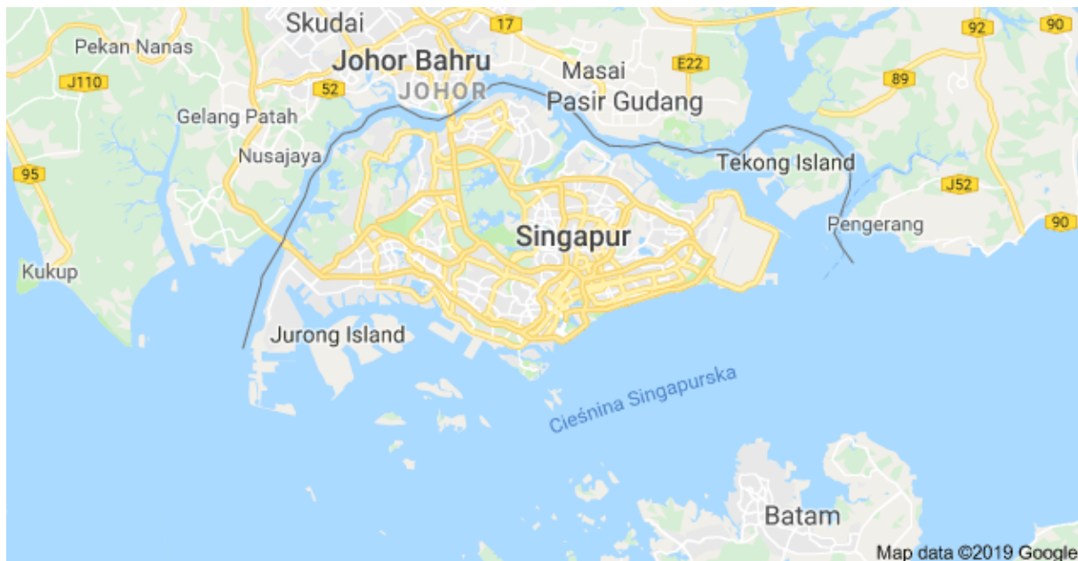
Fig. 1. Geographical location of Singapore

The Singapore seaport is the busiest transshipment hub in the world. Located at the southern end of the Malay Peninsula, 30 km southwest of the port of Johor in Malaysia, it provides connectivity to more than 600 ports in 123 countries. 2 The island nature of the city-state of Singapore (besides the main island of Singapore, it contains 60 small coastal islands) determines the dynamic development and excellent maintenance of both linear and point infrastructure of transport, and maritime transport in particular.