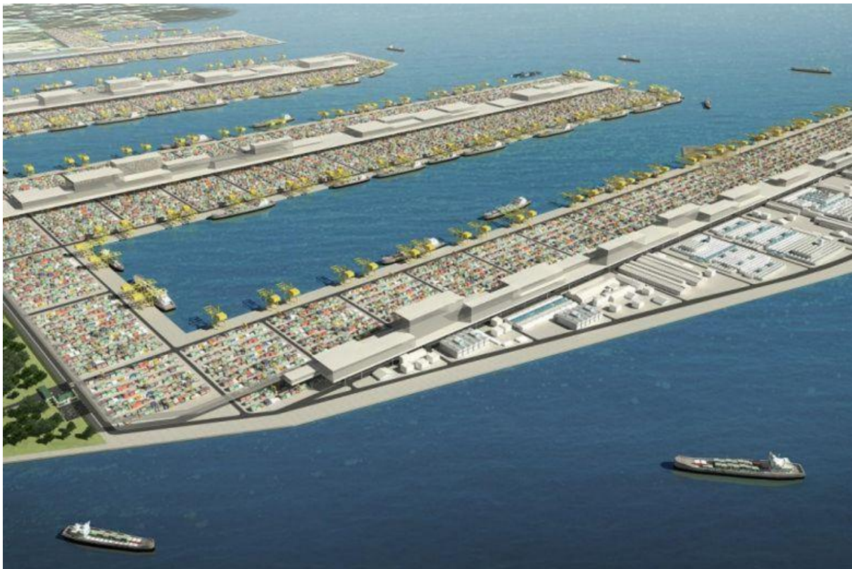
Fig. 4. Visualisation of the Tuas mega port

Owing to its excellent connectivity solutions and excellent modern port infrastructure, Jurong Port Combi Terminal provides for transhipment of different types of containers and general cargo on multipurpose vessels.