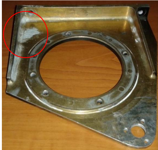
Fig. 4. The test specimen with this shape, the state before excitation Rys. 4. Próbką, stan przed wzbudzeniem