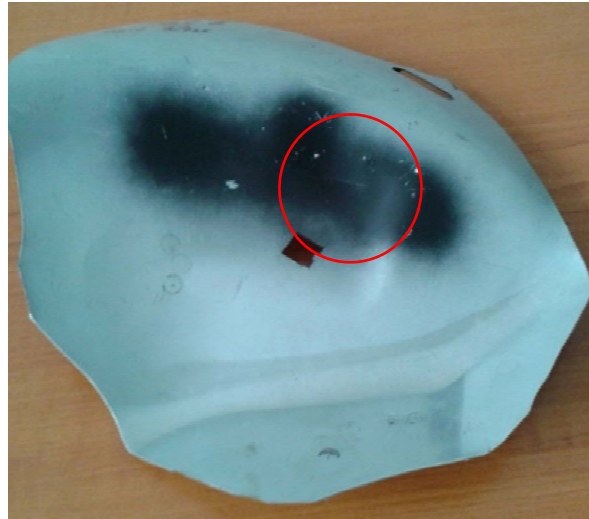
Fig. 2. The test sample with this shape before excitation, instead of the expected damage is sprayed by spray of know emissivity

Measurements were made using the system UTvis. It is equipment based on lock-in method with high energy ultrasound excitation. The material of specimens was chosen steel. There were two specimen with different shapes tested (Fig. 2, Fig. 4). These specimens were tested with more setting. It was only the excitation frequency and the frame rate frequency of the camera changed. Parameters like emissivity, integration time number of periods were equally.