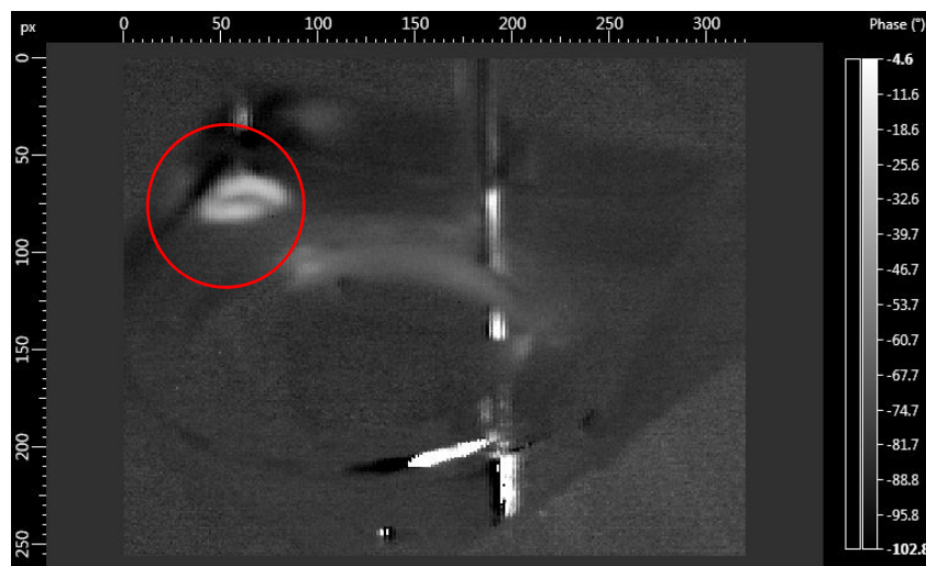
Fig. 5. Specimen after excitation. There is possible to see inhomogeneity with circular shape in the left top corner