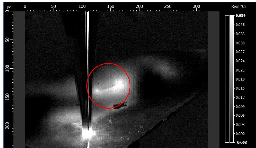
Fig. 3. Specimen after excitation. There is possible to see crack with I shape

Rys. 2. Próbka przed wzbudzeniem, miejsce przewidywanego uszkodzenia spryskane sprejem ze znaną emisyjnością