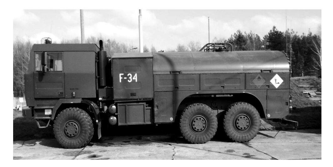
Fig. 6 Tanker distributor with a capacity of 10,300 l (CD-10) for the transport and distribution of aviation fuel on the JELCZ 662 chassis operated by the Armed Forces

The second type of the distributor tanker is a modern design from 2007-2010 and it is built on the Jelcz 662 car chassis with 6x6 drive. This vehicle was initially produced for the army and was intended for land operations, but was subsequently redesigned for air units. This vehicle construction is adapted to operate both on paved roads and on off-road routes and has the ability to overcome water obstacles with a depth of up to 1.2 m.