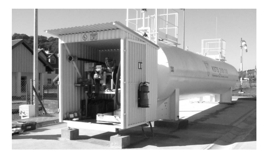
Fig. 4. Border Guard landing area - an aircraft refuelling station with a capacity of 30,000 l, equipped with a distribution node

Stationary distribution devices are used in addition to tanker distributors in larger airport facilities (Border Guard or Police landing field). These devices enable the storage of larger amounts of fuel, supplemented with necessary operational additives (additive to prevent water crystallisation) and the fuel supply to the aircraft tank. Moreover, these devices are also equipped with the necessary filters or monitors, which guarantee high fuel quality.