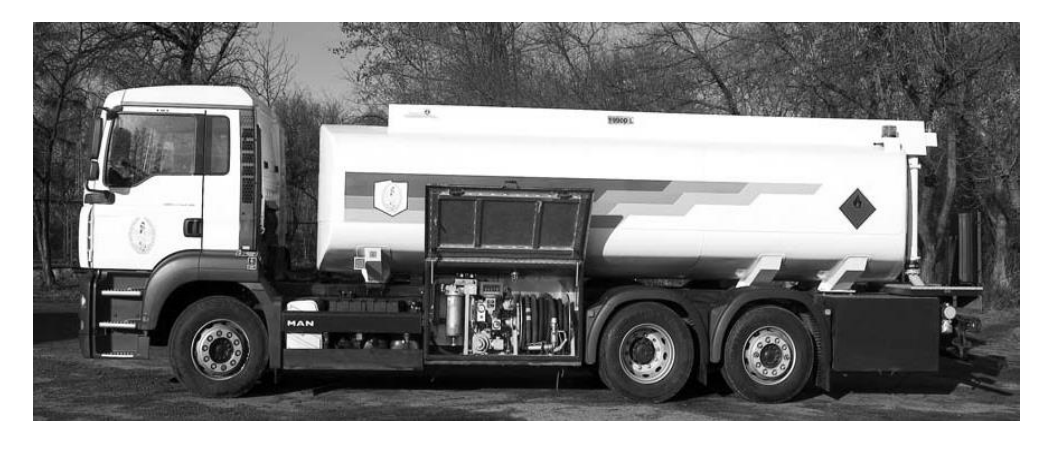
Fig. 2. An 18,000-litre transport tanker (CT-18) with the possibility of distributing aviation fuel to aircraft on a 6x2 MAN chassis operated by the Border Guard

Selected technical parameters of distributors' tanks operated by the Border Guard and the Police