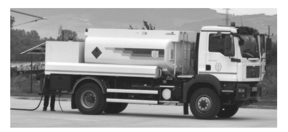
Fig. 1. Tanker distributor equipped with a MAN 4x4 chassis, with a capacity of 7,500 l (CSDL-7) for the transport and distribution of aviation fuel, operated by the Border Guard

To accomplish the above tasks, helicopters are most often assigned to carry out tasks from small airports or landing areas without a constructed runway. Reaching these landing sites, especially in crisis situations or natural disasters conditions, will require transport equipment with adequate capabilities to navigate on dirt roads or off-road. This feature is referred to as high operational mobility. This type of vehicle has an all-axle drive, suitable for wading (overcoming shallow-water obstacles). Vehicles will move along paved roads in order to reach the aircraft, however, at the stage of refuelling the tanker should drive as close as possible. Often there have been cases of serious difficulties in moving tankers near helicopters. Tankers distributors are usually equipped with delivery hoses with maximum length of 20 m and the tanker must be located at a distance of maximum 18 m from the helicopter to efficiently fill the helicopter tank with fuel. In practice, these are smaller distances, which forces the tanker to enter the school playground, meadow or other terrain allowing safe helicopter landing. [3] Only vehicles with off-road chassis will be able to safely reach the aircraft. It also limits the transport possibilities of the vehicle. Most often, these are 4x4 or 6x6 vehicles with main tank capacity for aviation fuel up to 7,500 litres.