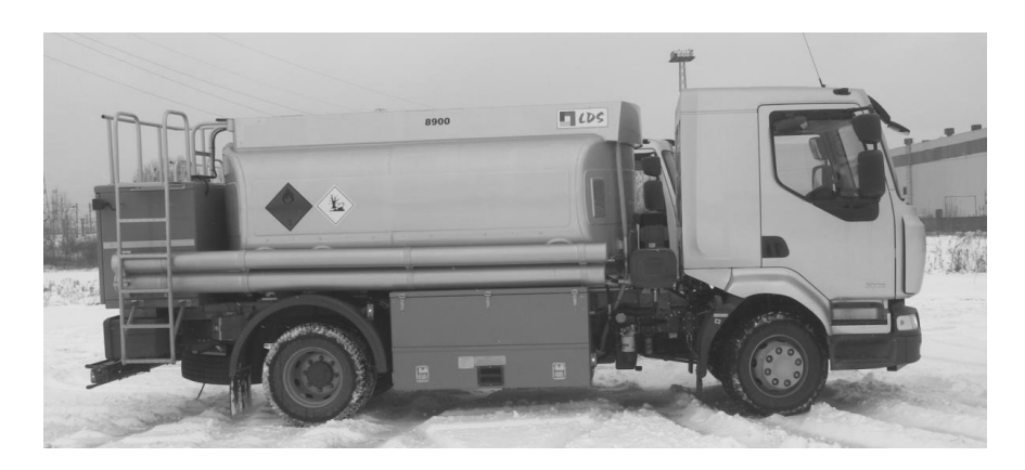
Fig. 3. Tanker distributor with a capacity of 8.900 l (CD-9) for the transport and distribution of aviation fuel on a RENAULT 4x2 chassis operated by the Police

Stationary distribution devices are used in addition to tanker distributors in larger airport facilities (Border Guard or Police landing field). These devices enable the storage of larger amounts of fuel, supplemented with necessary operational additives (additive to prevent water crystallisation) and the fuel supply to the aircraft tank. Moreover, these devices are also equipped with the necessary filters or monitors, which guarantee high fuel quality.